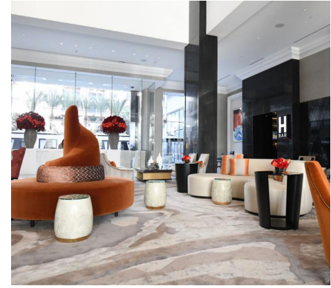
The lobby of the Post Oak Hotel.

The hotel's exterior is made of limestone, granite and marble. Its