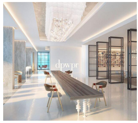
Dancie Perugini Ware Public Relations preleased 12,500 square feet on the eighth floor.

BY CARA SMITH | CARASMITH@BIZJOURNALS.COM