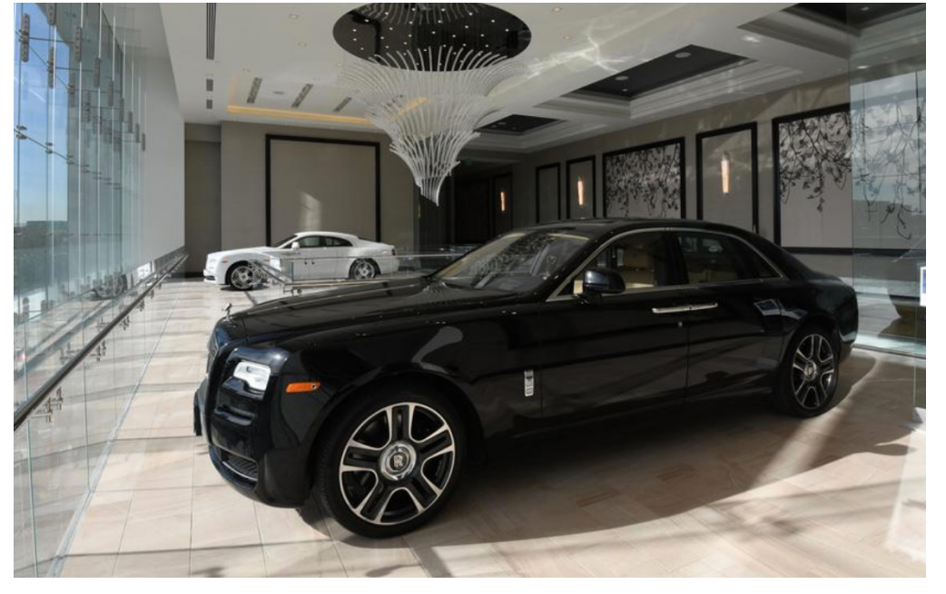
Post Oak Motor Cars, a two-story luxury car showroom, is home to Bentley, Rolls-Royce and Bugatti Houston, the only Bugatti dealership in the Houston area. Several cars are showcased on the main floor, and a handful more can be seen through the floor-to-ceiling glass windows outside a few feet away from the patio of Craft F&B, one of The Post Oak's restaurants. By climbing the large white three-story glass and stainless-steel spiral staircase, guests will see more cars available for purchase. Hotel guests have the option of complimentary transportation by a Bentley or Rolls Royce property vehicle within two miles of the hotel.

Bloom & Bee, a 2,500-square-foot restaurant serving fresh, locally inspired American cuisine, is reminiscent of a tea party inside a beautiful rose garden. Guests sit on velvet pink chairs at the bar or main dining area, which has a ceiling of abstract glass flowers and has views of the pool area. Bloom & Bee is open Monday through Sunday and serves breakfast, lunch and dinner.